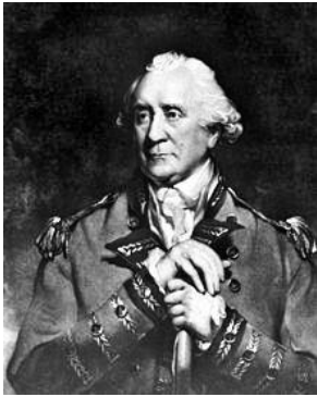
Governor Patrick Tonyn

Augustin Prevost became the British Commandant of East Florida, accompanied by the Royal American Regiment. He had fought under General Wolfe at the Battle of Quebec, and recognised that his men could less readily be seen if they did not wear red.